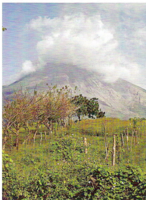
Shrouded in clouds, the volcano observes an almost 50-percent dnf rate

It goes without saying that this race could not have happened without the incredible support of our volunteers and sponsors. Locals and foreigners (including Peace Corps) donated their time to this race. Volunteers and runners alike were also integral in the success of our pre-race trash cleanup day, and our post-race Calzado Para Ometepe kids’ 5K. The objective of Fuego y Agua was not just to host a race, but also to help promote awareness of the island, its culture, and the forests that thrive on the volcanoes. ■